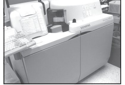
Closed system (above) weighs 750 pounds. Under the hood (right), test tubes move through for analysis. The machine performs up to 400 laboratory tests per hour.